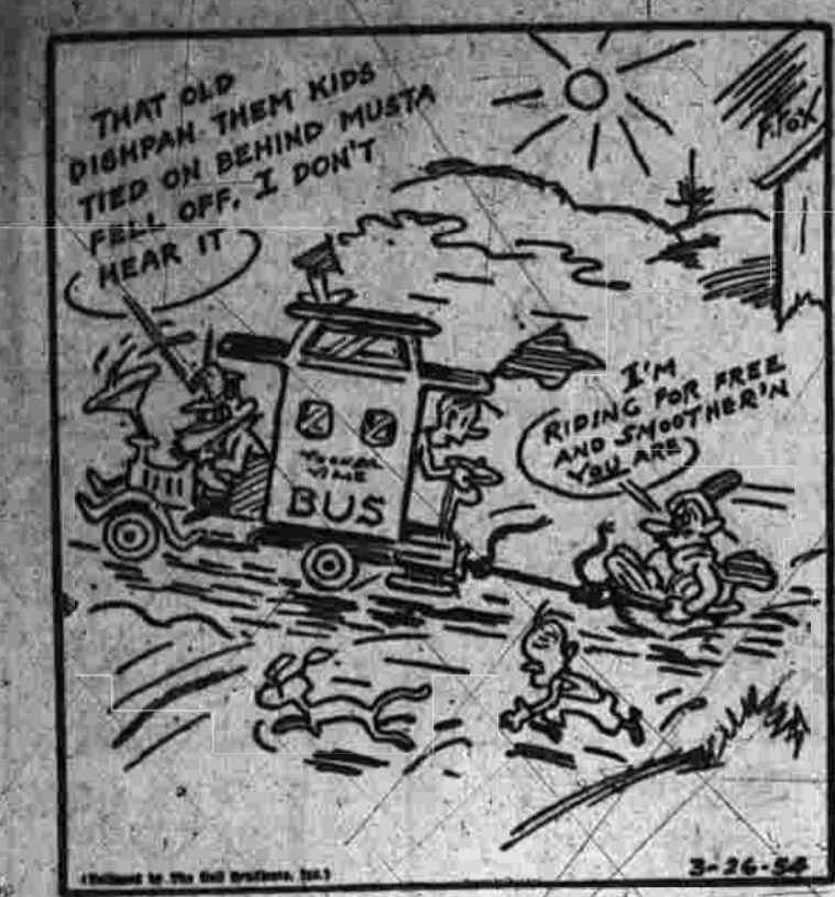
TOONERVILLE FOLKS BY FOUNTAINE FOX FUNNY BUSINESS