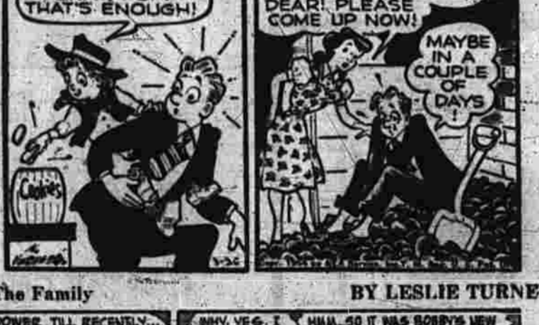
About The Family BY LESLIE TURNER