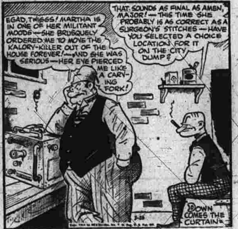
Who's Afraid? BY V. T. HAMLIN