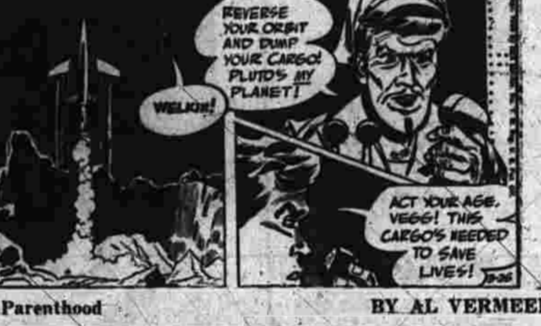
Perils of Parenthood BY AL VERMEER